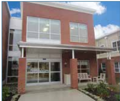
Springside School Senior Housing • Burlington Township, NJ NJ Future Smart Growth Award Architect: Kitchen & Associates