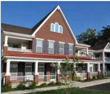
Medford Senior Residence • Medford Township, NJ Affordable Housing Finance Magazine - Readers' Choice National Finalist Architect: Kitchen & Associates