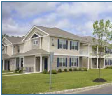
Sharp Road Family Housing • Evesham, New Jersey NJ Governor's Excellence in Housing Award Architect: Kitchen & Associates