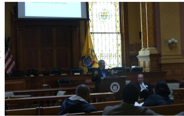
Jersey City land banking session last Oct.

together to get this proposal passed, so we are developing materials for Network members and allies to use to help create momentum. We will soon have available a sample resolution you can use with local and Contact you state legislators and ask them to co-sponsor and support the bill. We will keep you up to date will any developments as the bills move through the legislative process. Read more about the efforts to introduce land bank legislation in the legislature from this NLIHC memo .