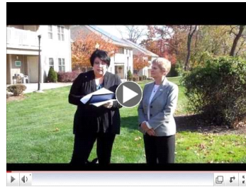
HUD HOME Program Cuts in Morris

UPDATE: THE HOUSE AND SENATE REACHED AN AGREEMENT ON NOVEMBER 14 TO CUT HOME FUNDING BY 38 PERCENT.